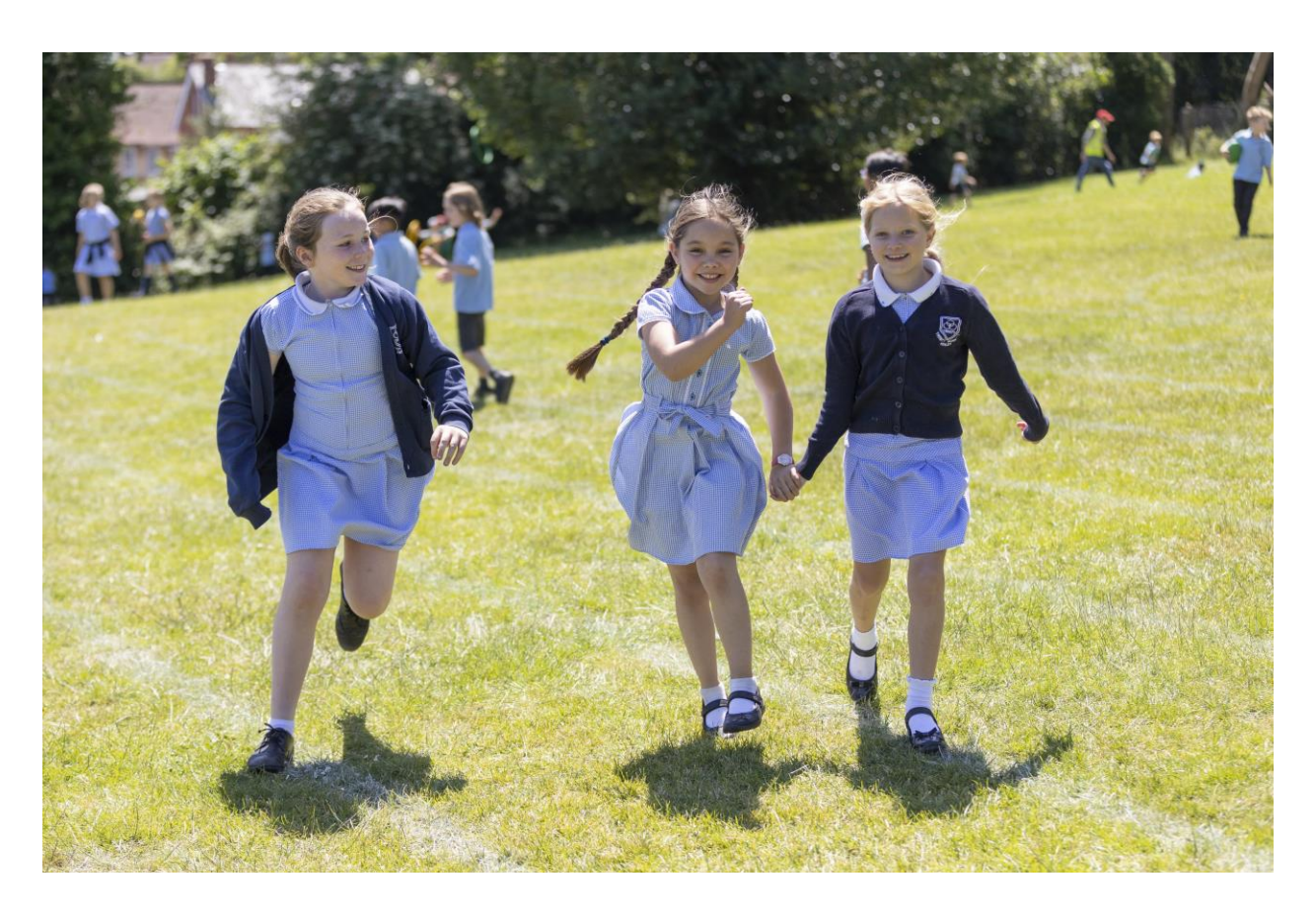
Trinity Newsletter - May 2024